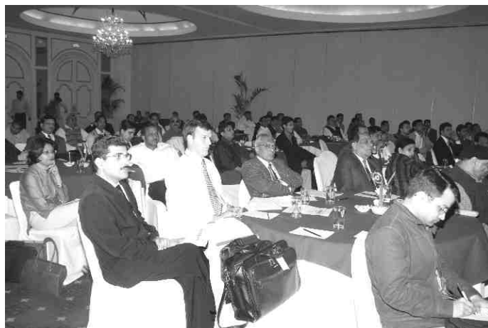
A View of Participants at the workshop

industries and prospective entrepreneurs, administrators and planners, scientists and technologists, marketing and nutrition specialists and exporters to come together to consider, debate and chalk out the strategies in view of domestic and global changes taking place and to submit recommendations on the same to the Government of India.